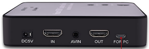
USB CABLE TO PC